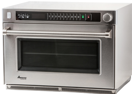
Model AMSO35 shown