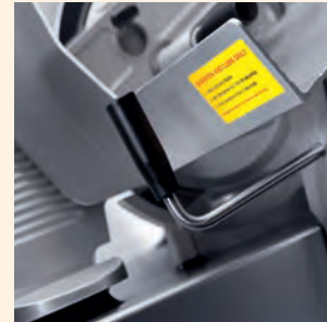
Remote sharpener, better food safety