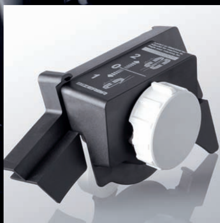
Removable sharpener: easy to operate by placing in a precise sharpening and removal position. Fully protected against unintentional contact.