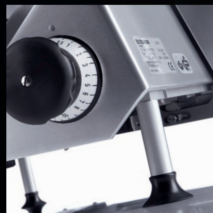
Raised feet for better cleaning of the counter surface under the machine.