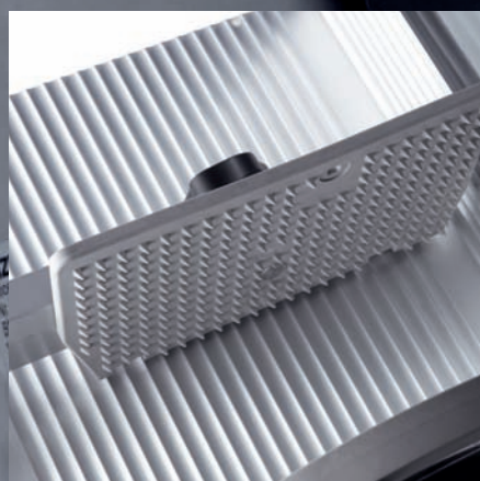
Sliding grooves in carriage plate, gauge plate and blade cover: these are all conditions for ergonomic operation that is gentle on the product.

The motors of the Bizerba GSP V are extremely quiet and run with a much lower power requirement: compared with other machines on the market, the GSP V has 35% less power consumption. In standby mode it even has zero power consumption. This is good for the environment and even better to save running costs. Day in, day out, year in, year out, and all round the clock.