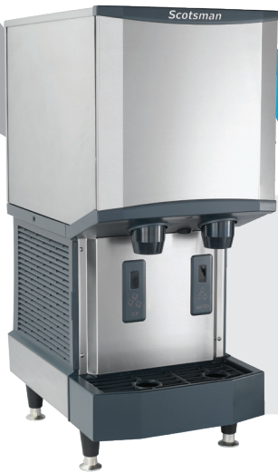
HID312A-1 with optional KLP24A legs