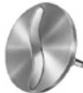
Adjustable Slice Plate - \frac{5}{8} " to very thin.