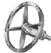
Plate Holder Assembly