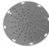
\frac{3}{16} " Shredder Plate