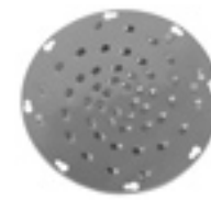
\frac{1}{2} " Shredder Plate