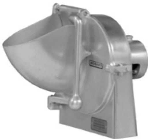
9" VEGETABLE SLICER

The 9" Vegetable Slicer may also be used with the PD-35 or PD-70 Power Drive units.