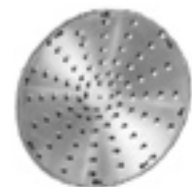
\frac{5}{16} " Shredder Plate