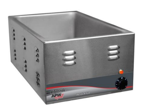
Model W-3Vi Countertop Warmer